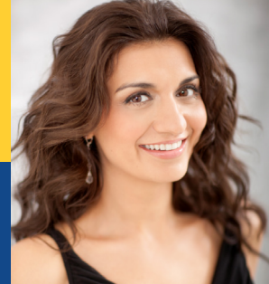
Dr. Isabel Bayrakdarian soprano

Located on over 1,000 acres of California coast, the UCSB campus is truly a learning and living environment like no other.